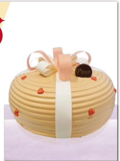
克勞德.畢卡索 Oreo and Caramel Cookies Flavor Cake

香草蛋糕、法式草莓香提、南洋芒果慕斯 Strawberry Chantilly / Mango Mousse