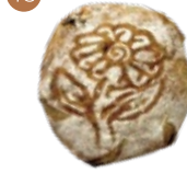
酒香貴妃 Lychee Artisan Bread