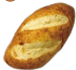
鬥牛士 Cheese Artisan Bread