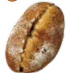
藍色精靈 Blueberry Artisan Bread