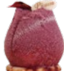
紫艷 Black Currant and Blueberry Flavor Cake