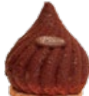
夢 Chocolate Flavor Cake