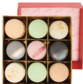
繽紛馬卡龍禮盒 Macaron Gift Box

4入禮盒 Gift Box of 4 pcs NT$280 9入禮盒 Gift Box of 9 pcs NT$600