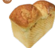
蜂蜜脆皮吐司 Honey Flavor Toast