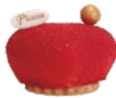
心 Raspberry and Rose Flavor Cake