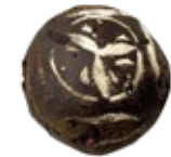
黑魔女 Chocolate and Grape Artisan Bread