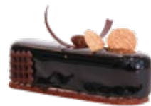
面紗之舞 Chocolate Ganache Flavor Cake