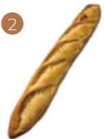
巴黎香 French Bread