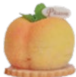
吻 Peach Flavor Cake