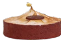
法式檸檬羅勒塔 Lemon Basil Tart