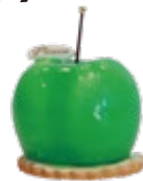
青蘋果樂園 Green Apple Flavor Cake