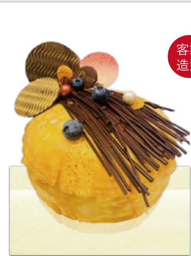
阿爾及爾 Chestnut Flavor Cake

巧克力蛋糕、法式巧克力慕斯、蜂蜜核桃、巧克力奶油香提 Chocolate Mousse / Walnut / Chocolate Chantilly