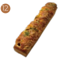
法式焗香吐司 Sausage and Cheese Toast