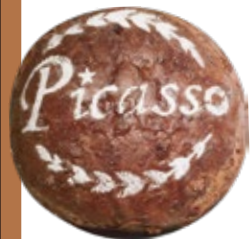
招牌紅心芭樂 Guava Artisan Bread