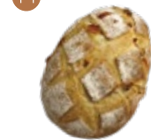
鋒芒 Mango Artisan Bread