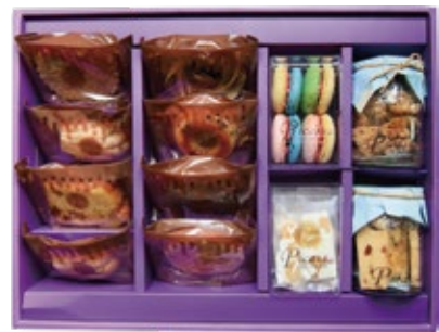
Picasso H2O BAKERY 經典禮盒 Picasso Classic Gift Set NT$780