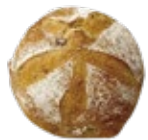
蜂之舞 Honey and Cranberry Artisan Bread