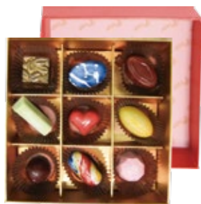
手工巧克力禮盒 Chocolate Gift Box