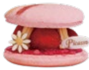
朵拉 Strawberry Macaron