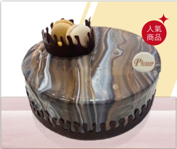
格爾尼卡 Chocolate Flavor Cake

巧克力蛋糕、法式巧克力慕斯、蜂蜜核桃、巧克力奶油香提 Chocolate Mousse / Walnut / Chocolate Chantilly