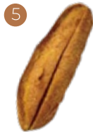
海王子 Cod Roe Artisan