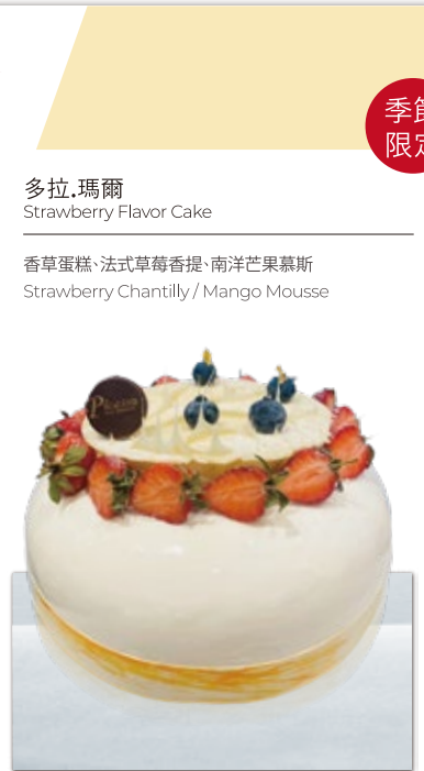
多拉.瑪爾 Strawberry Flavor Cake

香草蛋糕、香草奶油香提、法國栗子餡、法式卡士達餡 Vanilla Chantilly / Chestnut / Custard Cream