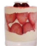
艾酒 Strawberry Fraisier