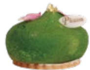
綠野仙蹤 Matcha Flavor Mousse Cake