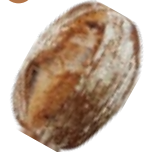
花香美人 Strawberry Artisan Bread